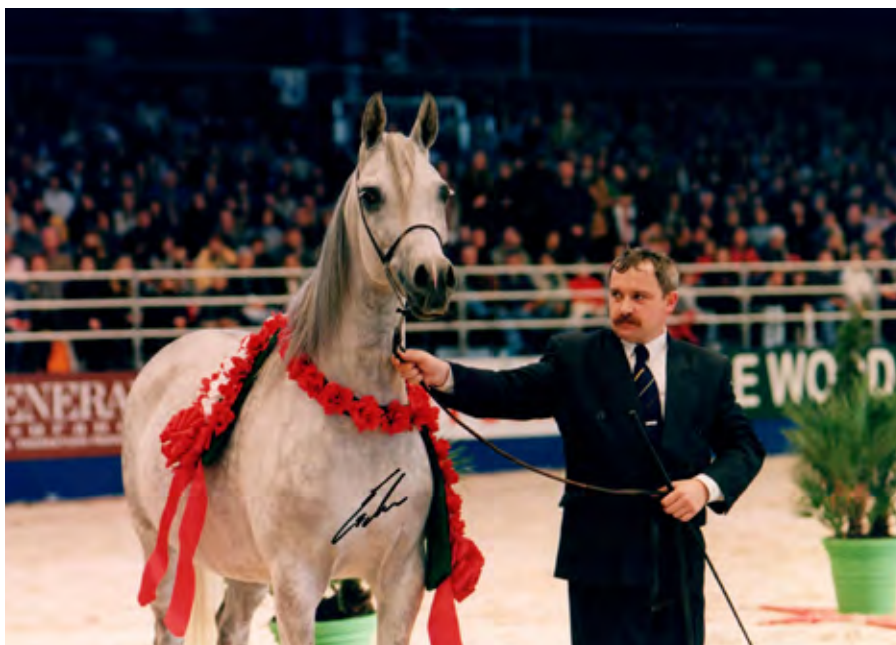
Zagrobla - Erwin Escher