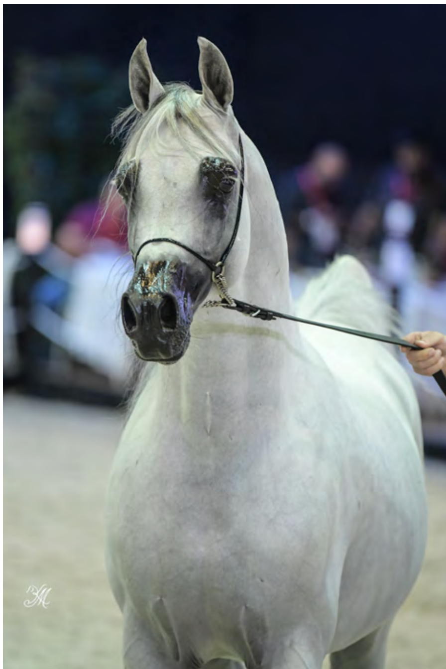
Złoty Medal

2023 was definitely the year of Złoty Medal as he only took part in three shows and brought home four champion titles. After missing out on the podium of Polish Nationals several times in his show career, the eleven-year-old stallion was determined to claim the crown in the 2023 senior stallions' championship. And he did it in style! After winning his class with an impressive score of 92.70, including a 20 for type, Złoty Medal hypnotised all six judges with his captivating performance in the finals and was named Unanimous Gold Champion Senior Stallion. His good fortune followed him to Prague, where he took part in the ECAHO A-class event and also placed first in his division, receiving