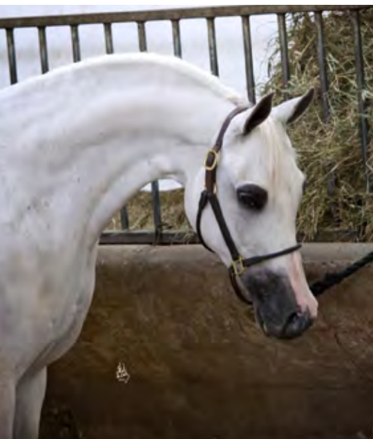
Złota Orda

Dreams / Magic Dream CAHR), the twelve-year-old Michałów-bred stallion represents the royal dynasty commenced by his paternal great-grandsire, 2017 Platinum World Champion Male, Gazal Al Shaqab (Anaza El Farid – Kajora / Kaborr) and continued further by his equally esteemed paternal grandsire Marwan Al Shaqab (out of Little Liza Fame / Fame VF), three times World Champion and a highly influential individual in his own right. Not many Arabian stallions can boast about having three multiple World Champion winners as their direct male ancestors but the more impressive fact is that the number of the most prestigious titles that these three stallions managed to gather over the years is directly proportional to the influence they had on the breed as sires. It is close to impossible to name all the halter show champions sired by these superb stallions but the fact that the three of them produced nine Platinum World title winners is an impressive and inspiring accomplishment which shows the great genetic prepotency of Gazal's family. Gazal himself sired three Platinum World Champion Mares: Pianissima (out of Pianosa / Eukaliptus), Pinga (out of Pilar / Fawor) and Emandoria