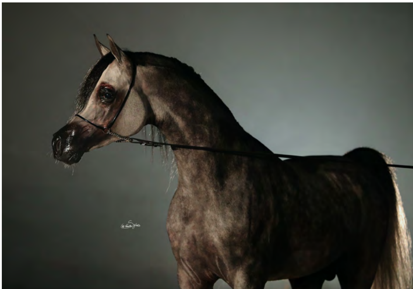
Ptolemeusz - Sylwia Ilenda